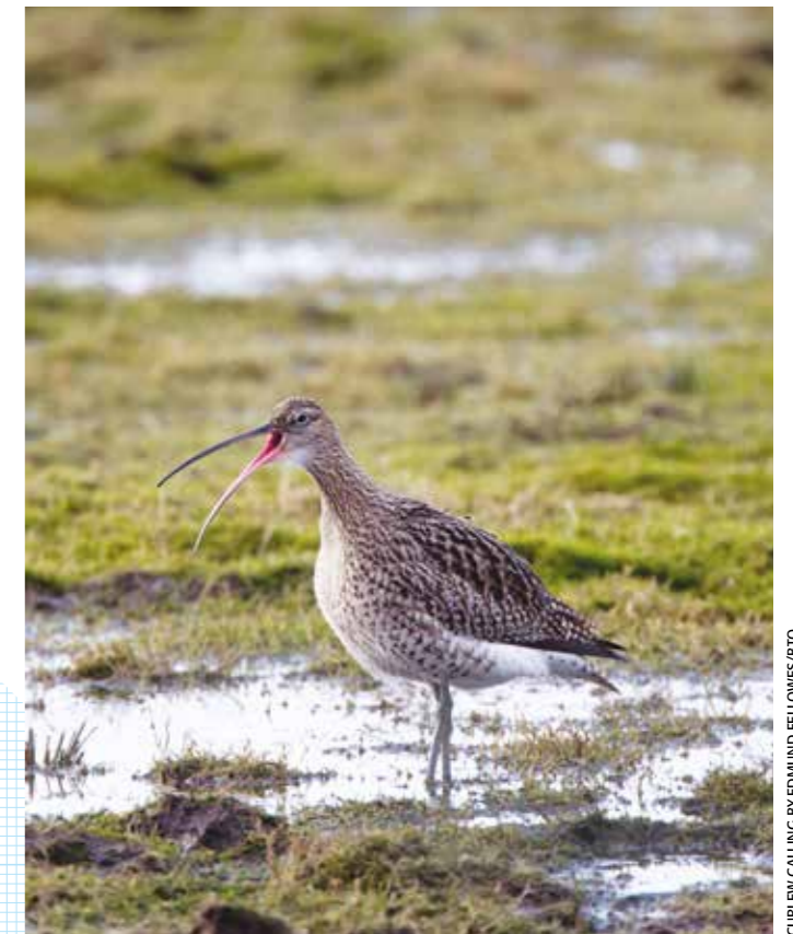
CURLEW CALLING

Investigating home range and habitat use of breeding Curlew. Breeding Curlew are generally failing to benefit from supposedly favourable habitat management undertaken as part of agri-environment schemes. Using remote tracking techniques, we will examine how breeding Curlew use upland areas and relate their movements and home range to aspects of upland landscapes such as the availability, extent, and management of moorland and grassland habitats used for nesting and foraging. This information can be used to adapt current habitat management strategies so that they actually benefit breeding Curlew.